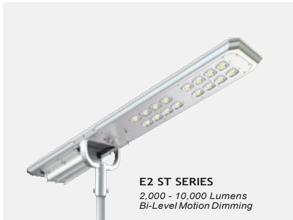
E2 ST SERIES 2,000 - 10,000 Lumens Bi-Level Motion Dimming

STANDARD KELVIN TEMPS ARE 3000K-6000K, LESS THAN 2% BLUELIGHT AVAILABLE.