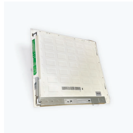
Emergency battery back up