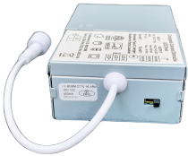
CCT Tunable Dip Switch